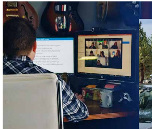
Learning looks different this fall and has added challenges for students.

These 100 first-year students 2020/2021 join nearly 100 second- and third-year LTCP students. Thanks to the generous support of LTCC donors, the Foundation will provide $80,000 to support LTCP students in the 2021-2022 academic year, including tuition for Nevada Lake Tahoe students, and $100 per quarter in book stipends and educational supplies. LTCP is the