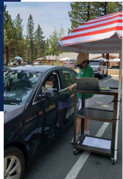
LTCC is shifting operations to better serve students during remote learning including drive-in registration, financial aid and counseling support.

first College Promise program to provide tuition-free education and academic, financial and other support to students from both California and Nevada in their educational goals.