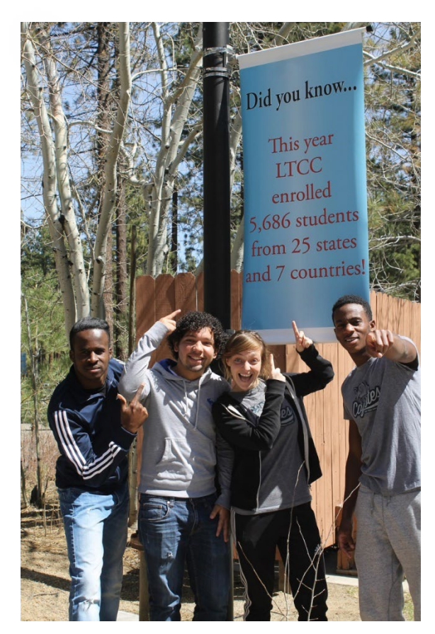
International students from England, Mexico, Australia and Jamaica are celebrating last week of spring quarter.

Once you are in the United States, it is important that you do not violate the conditions of your visa to maintain your status. <u>F-1</u> <u>students must maintain full-time status by enrolling in at least twelve (12) units per quarter</u>. You must notify the International Student Office immediately if you change your address or other contact information. You must also obtain written authorization from the International Student Office prior to leaving the country for holidays or other breaks.