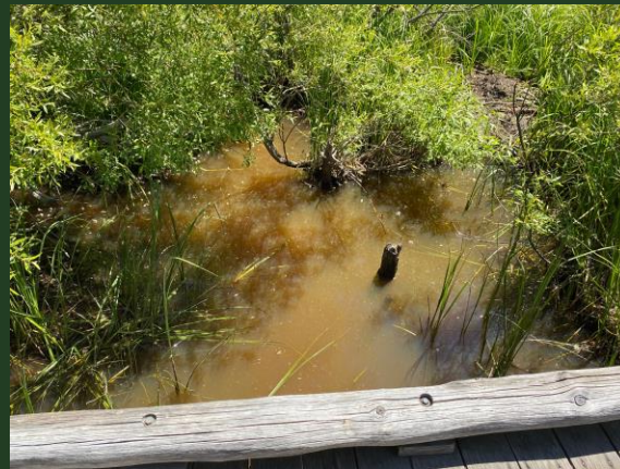
Fig 12 & 13.

Fig 12 & 13 below left, show stagnant waters in marsh area. How might this benefit the wildlife. Other than creating a breeding ground for mosquitos?