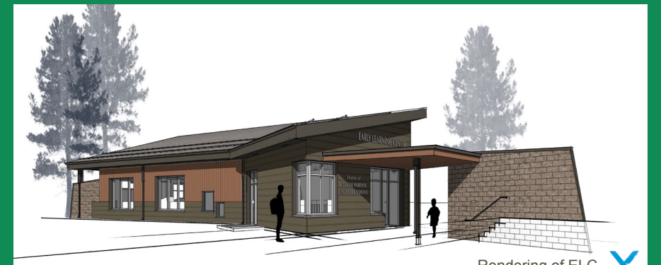
Rendering of ELC