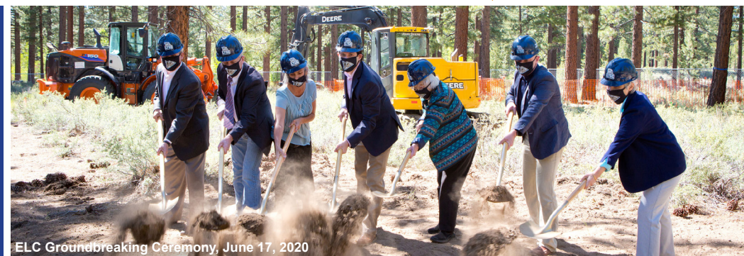
ELC Groundbreaking Ceremony, June 17, 2020

Enclosed an existing space within the library, with new interior glazing and doors, to create a quiet study space for students.