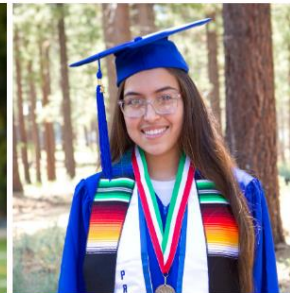
Interested in Free Tuition