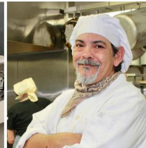
Seeking Job Skills