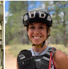
A Community Member