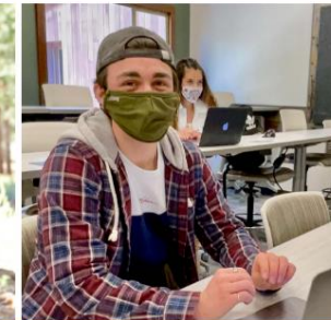
An Online Student