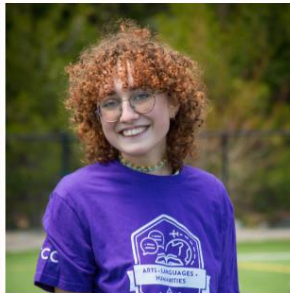
A Future Coyote