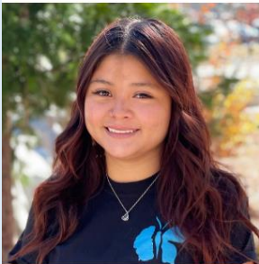
A Current Coyote

Lake Tahoe Community College California's Premier Destination Community College