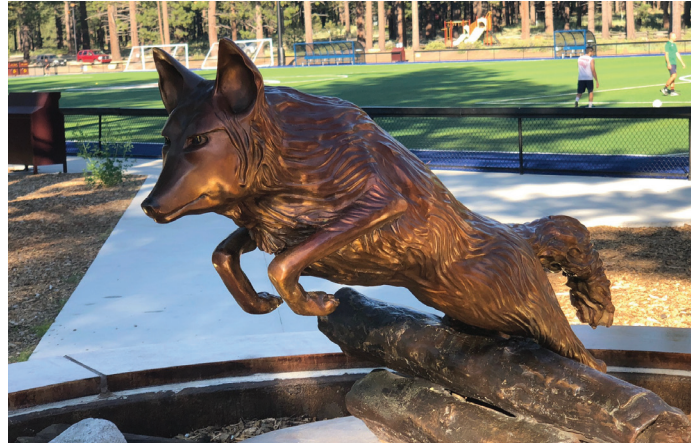
The bronze coyote statue at the Legacy Plaza.