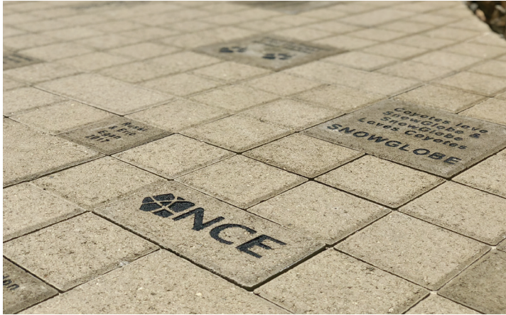
Engraved pavers at the Legacy Plaza.