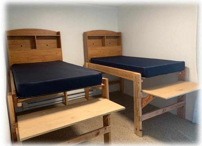
LTCC Residential Housing Dorm Room

Please dispose of all trash in the large, green trash dumpster located in the parking lot. Trash left outside of units attracts wildlife; therefore, leaving trash outside a unit will result in a fine.