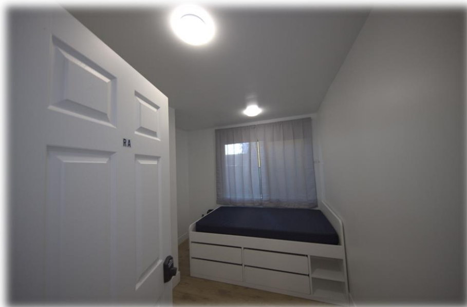
LTCC Residential Assistant Bedroom

The waiver by LTCCSH of any breach of a term or condition of this License Agreement shall not constitute a waiver of any other or subsequent breach.