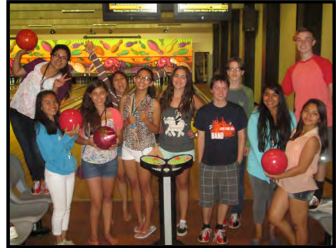
Bowling at Cal Poly