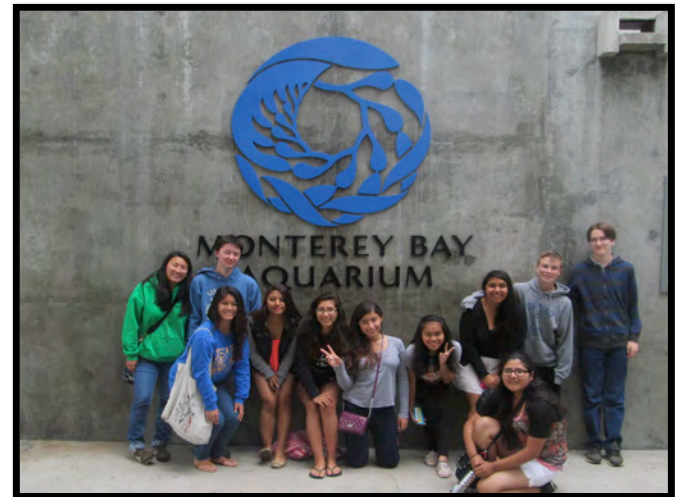
Monterey Bay Aquarium