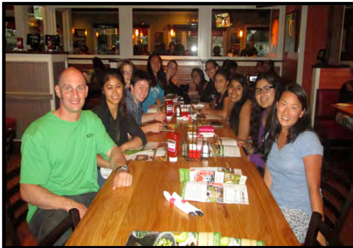
Chili's Monterey, CA